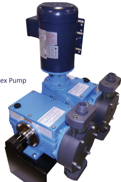
Double Simplex Pump

With UGSI Chemical Feed products, you do not have to compromise on a marginal liquid feed and controls technology for a particular application. Instead, you can choose from multiple technologies to match the best pump to your application.